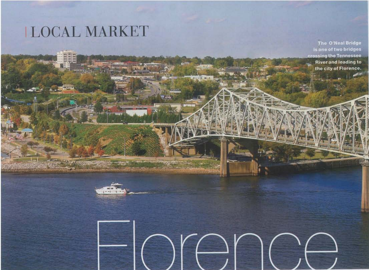
The O'Neal Bridge is one of two bridges crossing the Tennessee River and leading to the city of Florence.